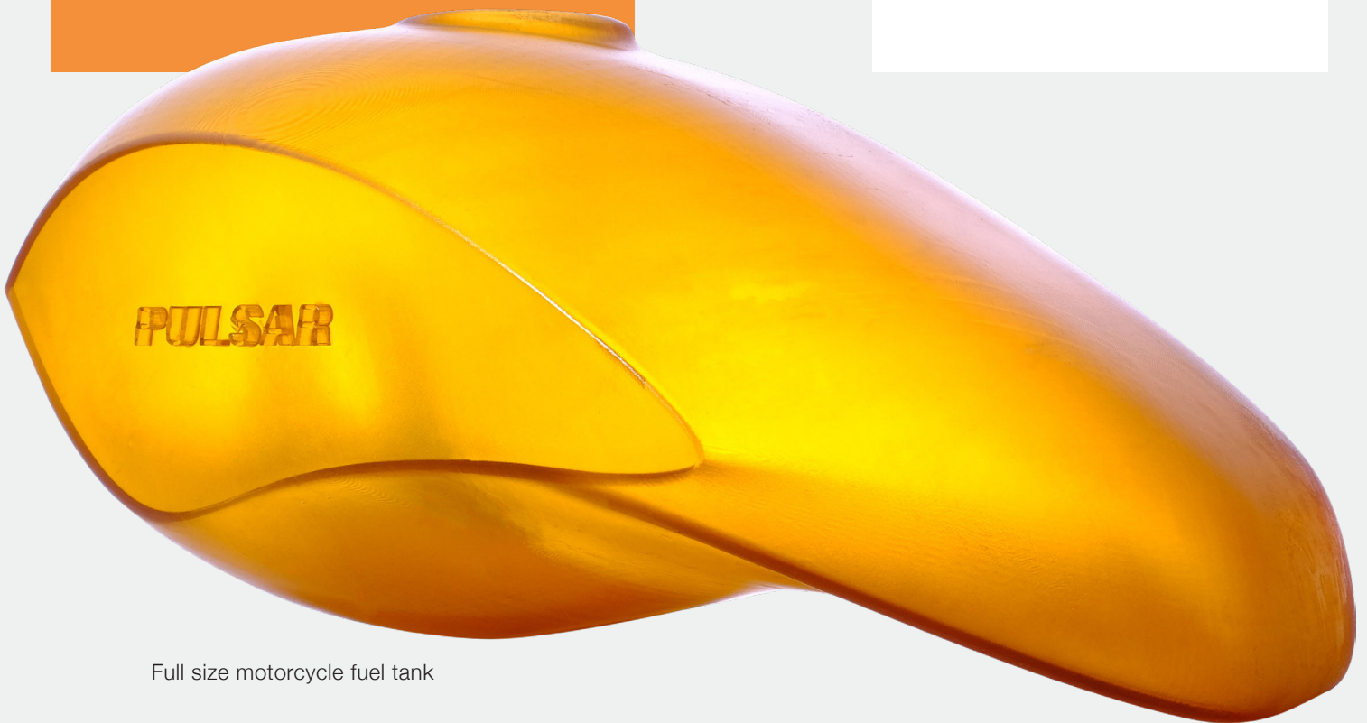
Full size motorcycle fuel tank

Photocentric's HighTemp DL400 is the first Photocentric high temperature resistant resin possessing superior properties of both strength and stiffness. It can handle impact, compression, fatigue, high temperatures and moisture without bending or deforming, able to print with an impressive layer thickness of 350µm.